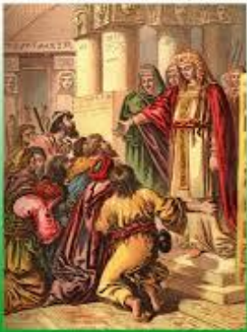
The Story of Joseph and His Brothers

Is Forgiveness Really Possible In Our Lives?”